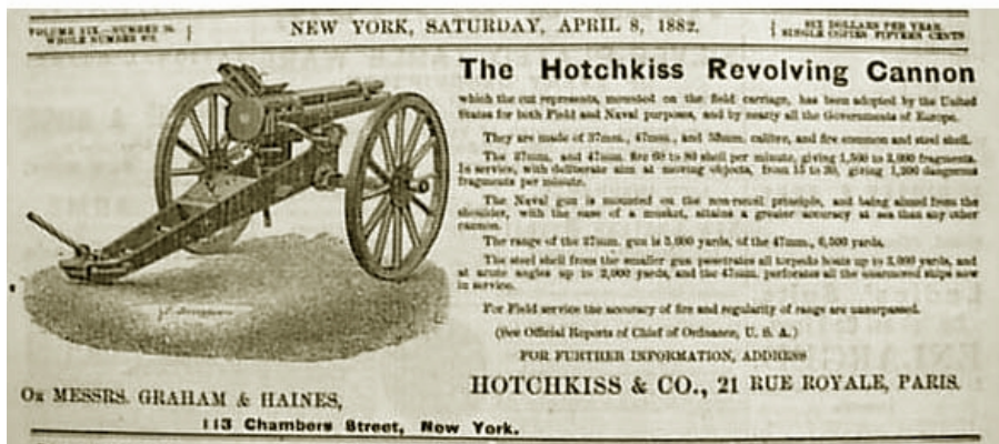
Figure 1.3. Hotchkiss Revolving Cannon

Ideologies of US settler colonialism directly informed Australian settler colonialism. South African apartheid townships, the kill-zones in what became the Philippine colony, then nation-state, the checkerboarding of Palestinian land with checkpoints, were modeled after U.S. seizures of land and containments of Indian bodies to reservations. The racial science developed in the U.S. (a settler colonial racial science) informed Hitler’s designs on racial purity (“This book is my bible” he said of Madison Grant’s The Passing of the Great Race ). The admiration is sometimes mutual, the doctors and administrators of forced sterilizations of black, Native, disabled, poor, and mostly female people - The Sterilization Act accompanied the Racial Integrity Act and the Pocohontas Exception - praised the Nazi eugenics program. Forced sterilizations became illegal in California in 1964. The management technologies of North American settler colonialism have provided the tools for internal colonialisms elsewhere.